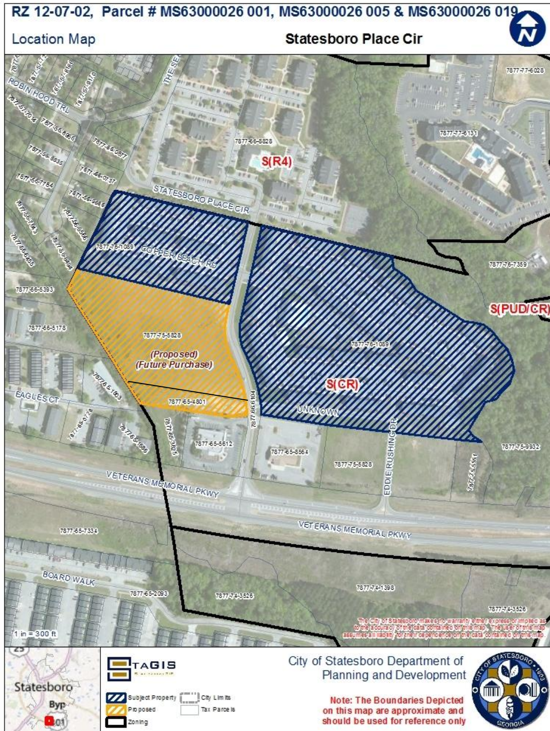
EXHIBIT A: LOCATION MAP