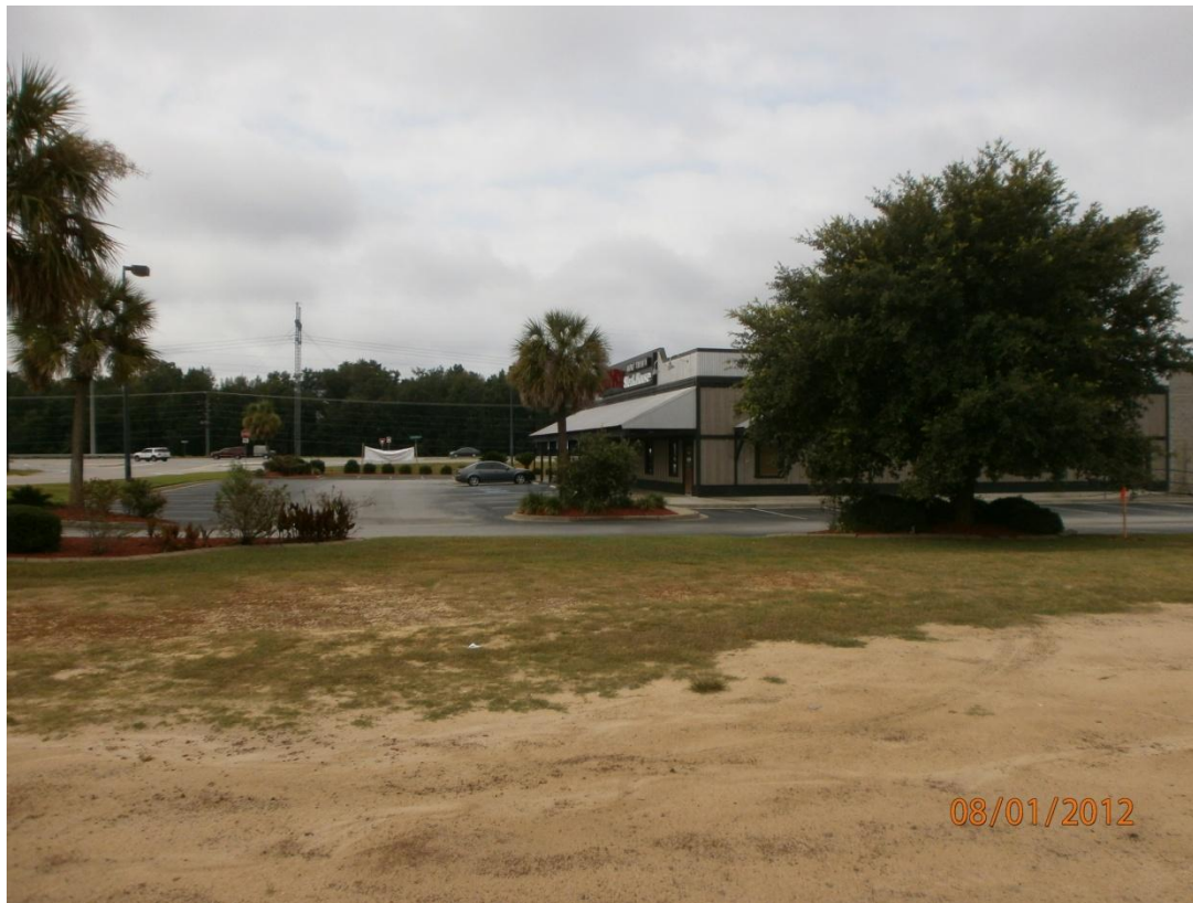
Figure 3: Southern Edge of the Subject Property facing Veterans Memorial Bypass.