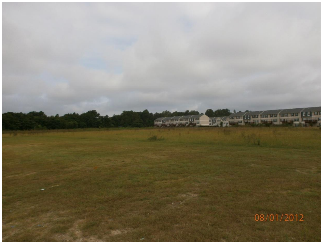
Figure 2: Subject Site from Statesboro Place Circle.