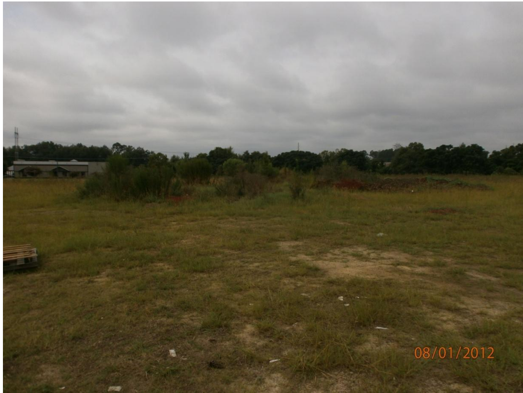
Figure 1: The 6.91 Acre Subject Property from the Existing Complex.